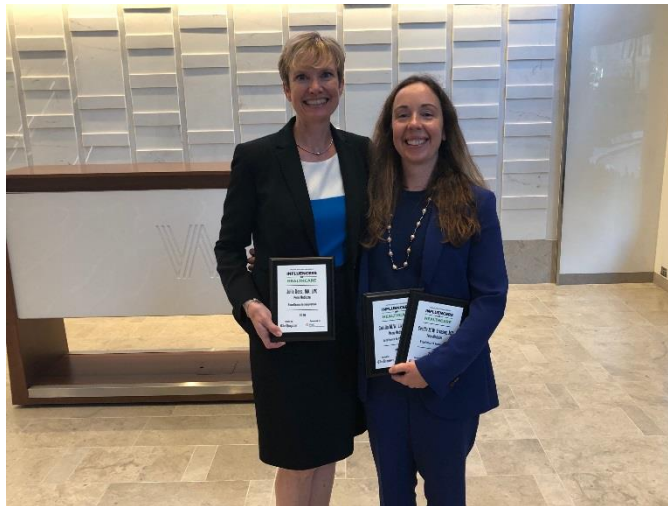
Philadelphia Inquirer Influencer of Healthcare for Excellence in Innovation Award